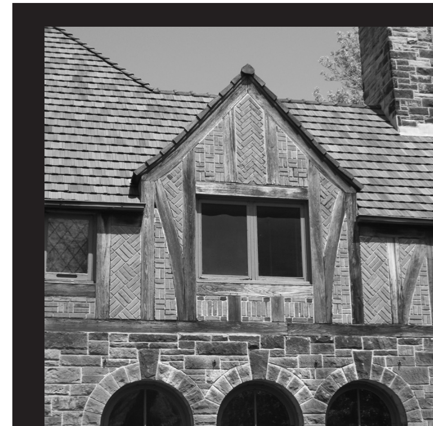
Details like these are what makes living in Murray Hill so interesting