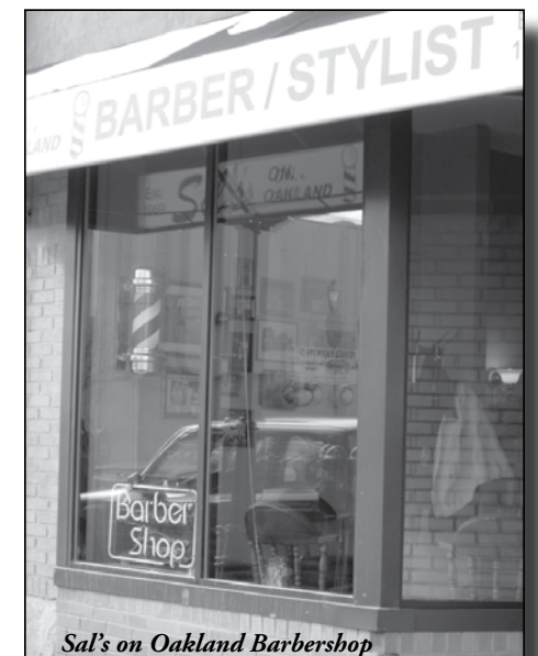
Sal's on Oakland Barbershop